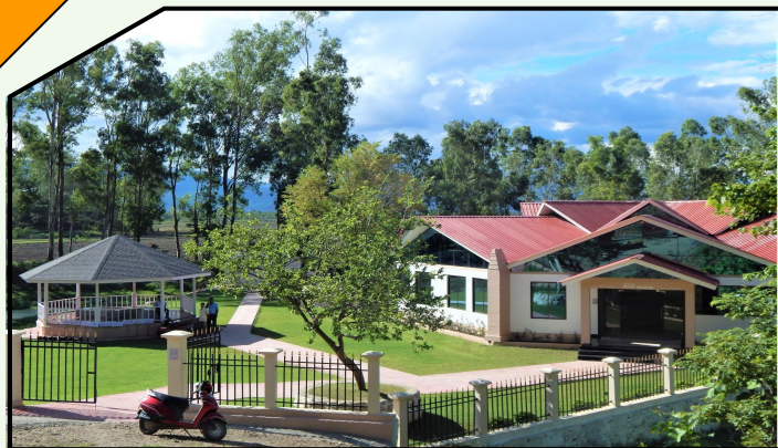
Imphal Peace Museum

Later on, the students were taken to visit the Imphal Peace Museum, which is a Japanese war memorial set up in Manipur. The museum is situated at the foothills of the Red Hills at Nambol. The Imphal Peace Museum exhibits the conditions during the war, the soldiers, the weapons, and Manipuri culture as well. It stands as a symbol of peace over war. Manipur is one of the few states in India to experience the second World War first hand.