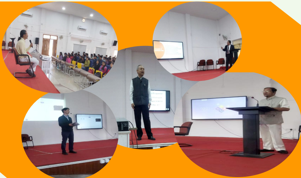
Experts addressing the students in the Orientation programme.

As part of the orientation programme, the students were divided according to their batches and taken to their respective classes under the guidance of the teachers. They were shown their classrooms and various laboratories in the campus. All the students introduced themselves in front of their classmates which helped the students to know each other well. The Induction session proved very beneficial for the students and it concluded with a splendid note. The Induction programme was followed by a field trip to various parts of Manipur which included trekking the hill which is behind the campus, visiting the Imphal Peace Museum , Loktak Lake and also Keibul-Lamjao National park.