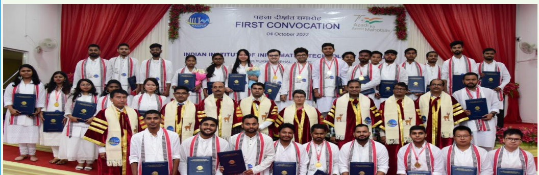
35 graduands with their B.Tech Degree certificates and teaching faculties of IIITM

In the First Convocation of IIIT Manipur, a total of one hundred and seventy-one (171) candidates for years 2019, 2020, 2021 and 2022 passed out batched were conferred with their degrees in Bachelor of Technology. Thirty-five (35) graduands have received their degrees in person and one hundred and thirty-six (136) graduands in absentia. Nine (09) Gold Medals were given to the first-rank holders for their exceptional academic performance.